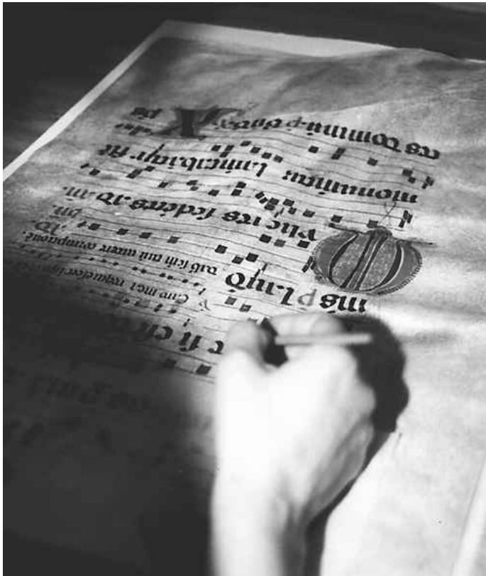
Fig. 1. Sturgeon air bladder membrane for making isinglass.

Glue can be extracted from fish by heating the skin or bones in water. The purest form of fish glue, made from the membrane of the air bladder (swim bladder) of certain species of fish such as the sturgeon, is also called isinglass ( fig. 1 ). Isinglass can be produced from various species of fish using diverse manufacturing processes. Depending on the manufacture, the purity of isinglass can vary. Historic