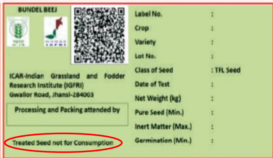
Figure 2. Breeder, foundation, certified and truthfully labelled seed tags