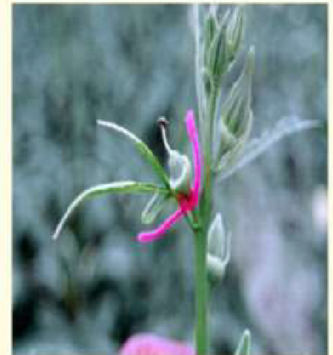
Red thread tied to the crossed flower bud