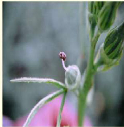
Pollinated flower bud