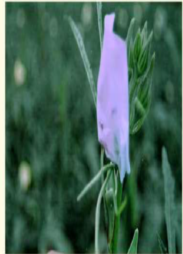
Bagging of emasculated bud

Plate 3(c): Steps involved in emasculation in bhendi hybrid seed production