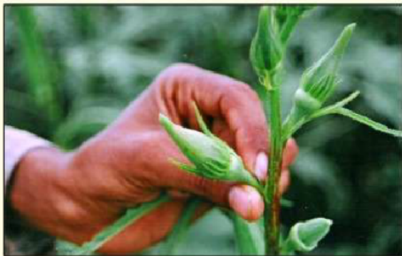
Selection of proper size bud

The buds opened next day, were selected in female parent and emasulation was carried out by removing the androecium along with the corolla. These emasculated buds were covered with butter paper pockets to avoid cross pollination and also for easy identification of emasculated flower for pollination. The emasulation was carried out daily from 2-00 to 6-00 pm (Plate 3). Care was also taken to remove the unemasculated flowers as per treatment and during