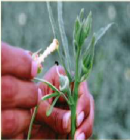
Pollination of emasculated bud

One male flower was used to pollinate four, six, eight and ten female emasculated buds as per the treatments and after crossing different colour thread was tied to the pedicel of the crossed buds for easy identification of the crossed bud. Pollination was carried out daily between 8-00 am to 4-00 pm depending upon the treatments (Plate 4). The crossing was carried out for a period of eight weeks from the initiation of flowering. The buds and flowers that appeared subsequently after the stopping of crossing programme were manually removed to facilitate better development of the crossed fruits and to avoid the selfed seeds in the hybrid.