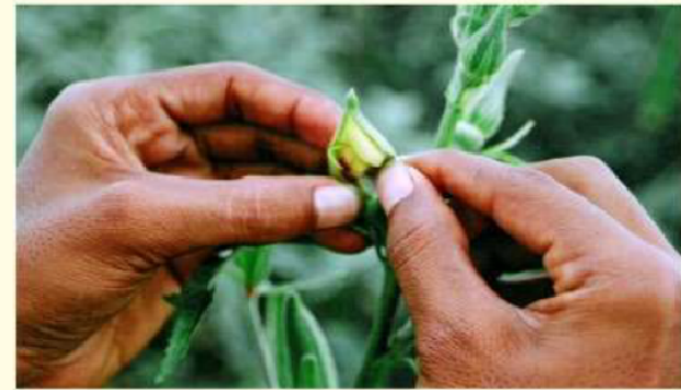
Emasulation of flower bud

Plate 3(a): Steps involved in emasulation in bhendi hybrid seed production